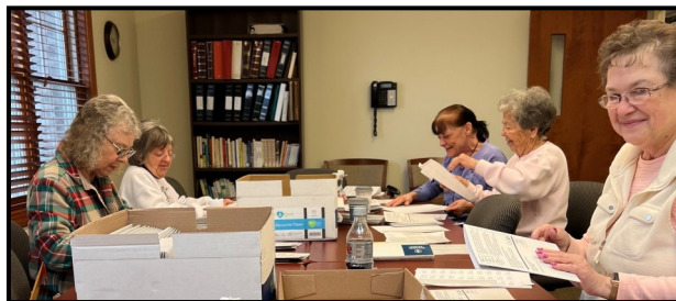
Senior Sounds Volunteers