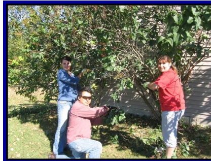
2013 Day of Caring Volunteers