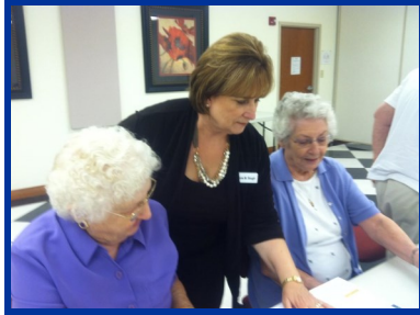
Insurance Assistance Volunteer